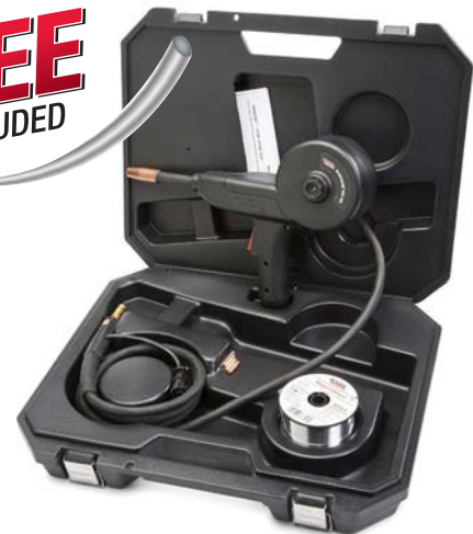
Complete Kit. No bulky module required. Order K2532-1