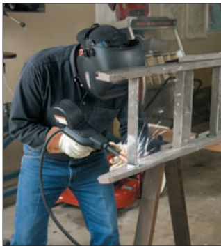
Great For Projects or Repair

Our low-priced spool gun is your most reliable aluminum feeding solution.